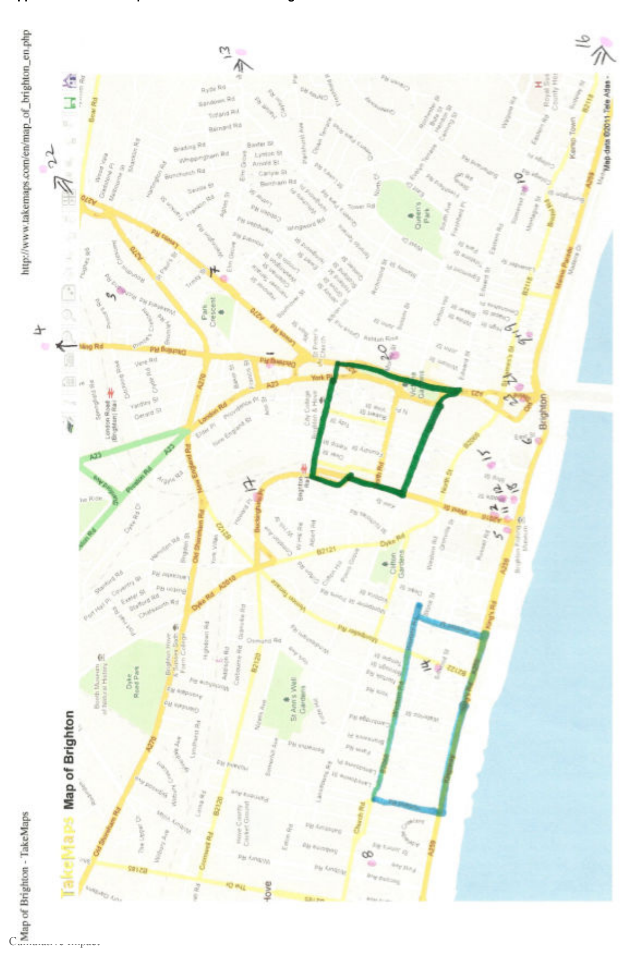
Appendix 1 Plotted map of licence reviews for Brighton & Hove